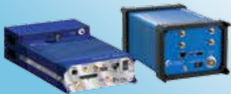
SeeGull® IBflex® and MXflex® Scanning Receivers

Products and Services for Network Testing, Optimization, and Design http://rfsolutions.pctel.com/