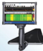
SeeWave™ Interference Locating System