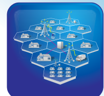
Network Engineering Services Design, Testing, Optimization