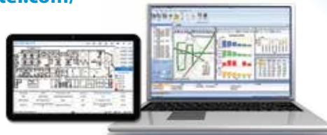
SeeHawk® Touch and SeeHawk® Collect Data Analysis Software